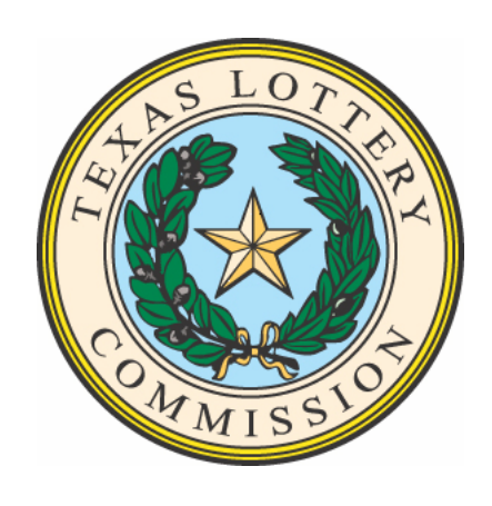
Agency Vision, Mission and Values