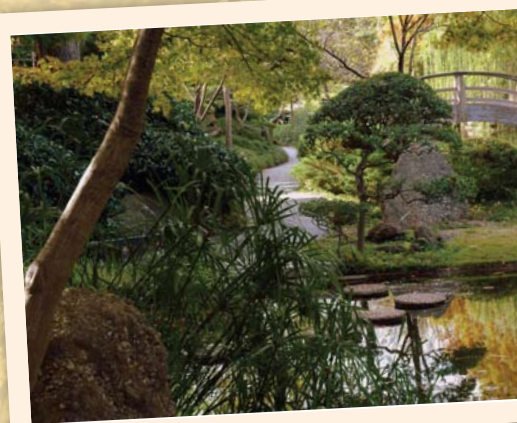
Fort Worth Botanica