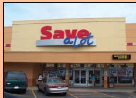
Save-A-Lot #723 in Victoria.

With more than 1,150 locations nationwide, Save-A-Lot is one of the largest grocery chains in the country and is currently expanding operations in Texas. When Save-A-Lot recently decided to begin selling lottery tickets in their locations, they knew the right place to start: Texas! [134783] Save-A-Lot #723 in Victoria sold the first ticket on March 6, 2008. Fourteen more locations from Dallas to Brownsville and in the Houston area are now selling the Games of Texas . Thank you Save-A-Lot for all you do to contribute to the Foundation School Fund!