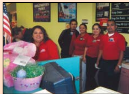
H-E-B #385 Business Center partners.

H-E-B joined the Texas Lottery in full force in 2002 and continues to encourage stores to participate in all contests and promotions, and